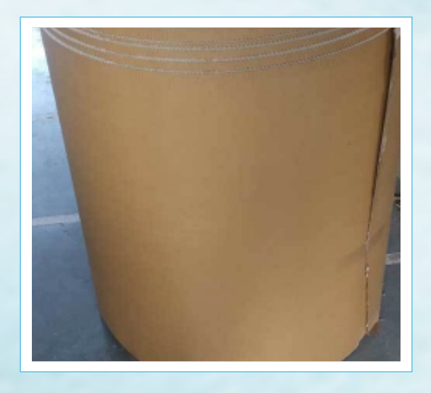
Brown Corrugated Rolls