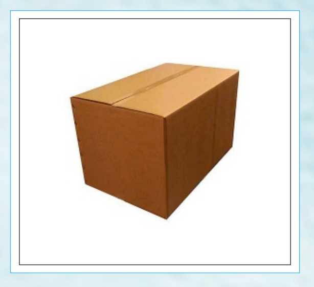
Cardboard Corrugated Box