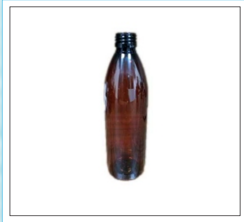
300ML Oval Pharma Pet Bottle