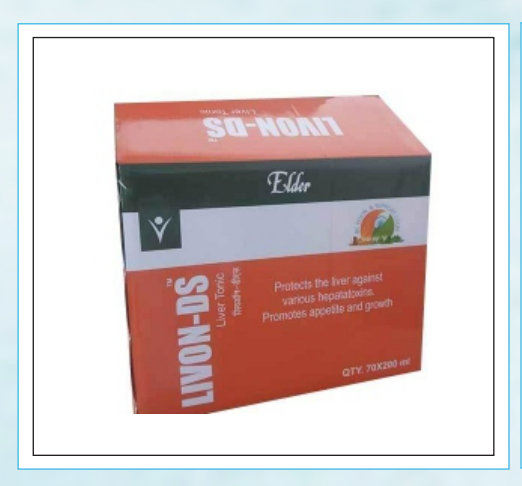
Printed Medicine Packaging Box