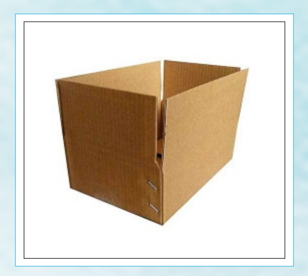
Plain Corrugated Box