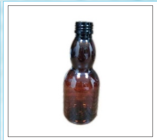
200ML Globag Pharma Pet Bottle