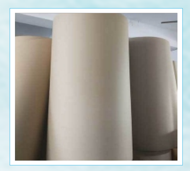
Plain Corrugated Rolls