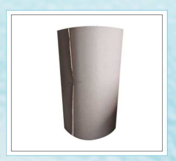
Corrugated Packaging Rolls