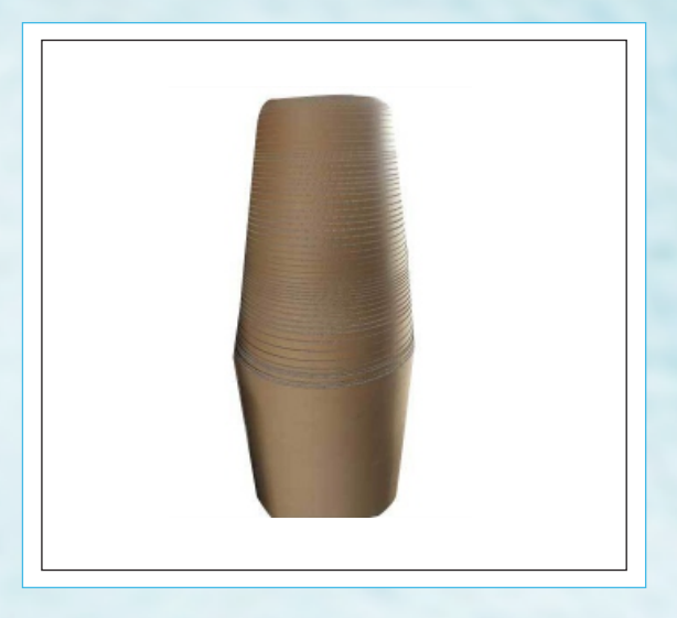
Corrugated Paper Rolls