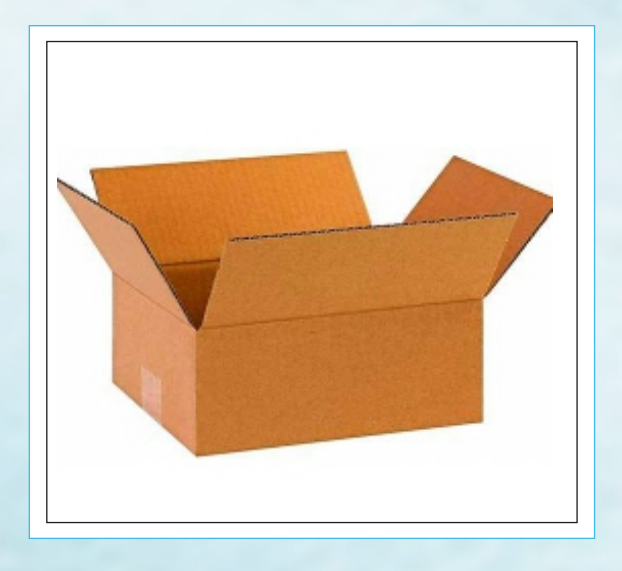
Brown Corrugated Box