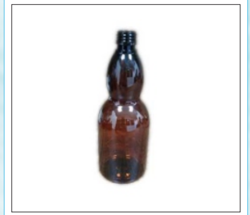
500ML Pharma Pet Bottle