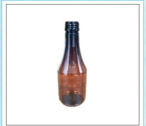
200ML Brute Pharma Pet Bottle