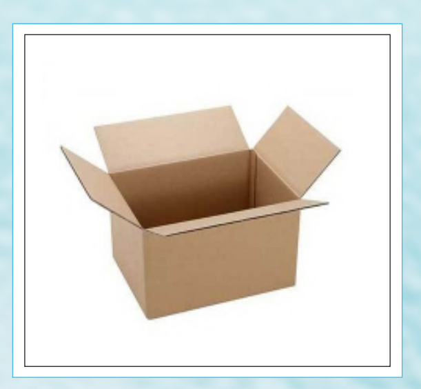
3 Ply Corrugated Box