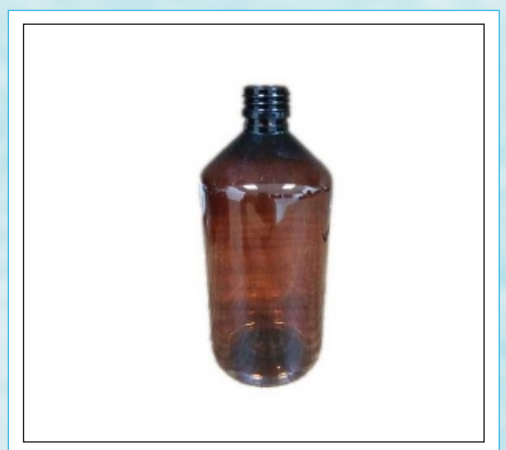
450ML Round Pharma Pet Bottle