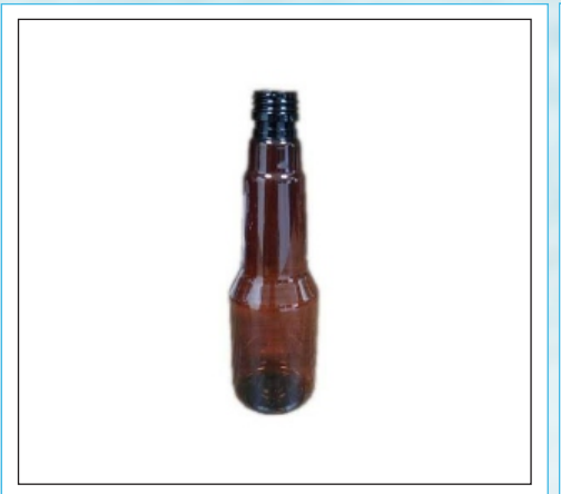
225ML Micro Brute Pharma Pet Bottle