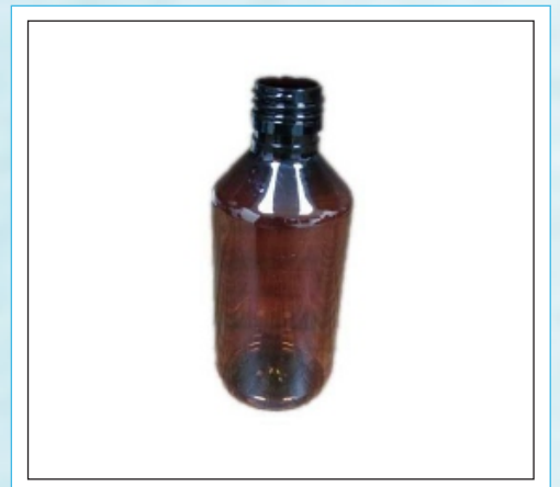
170ML Round Amber Pharma Pet Bottle 100ML Round Amber Pharma Pet Bottle